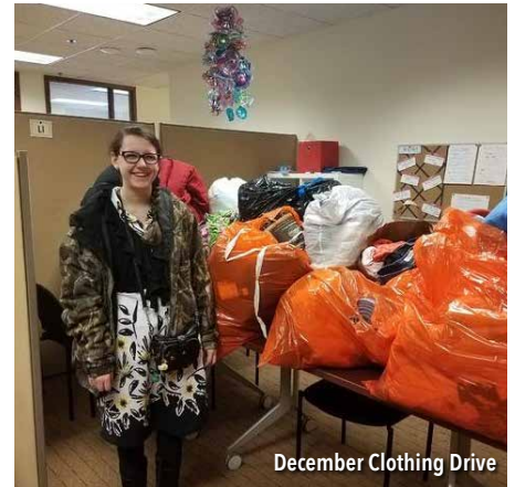
December Clothing Drive